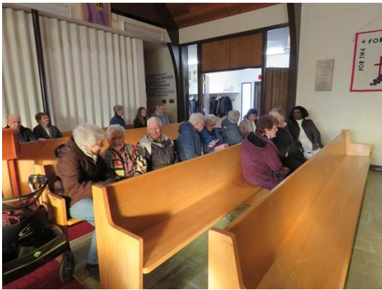
Waiting for supper