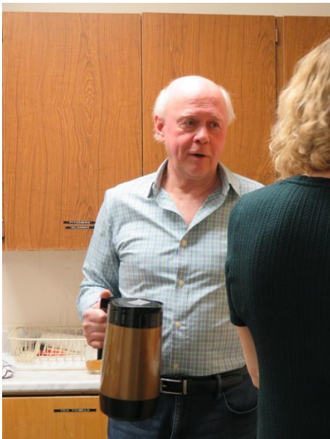
We all need coffee