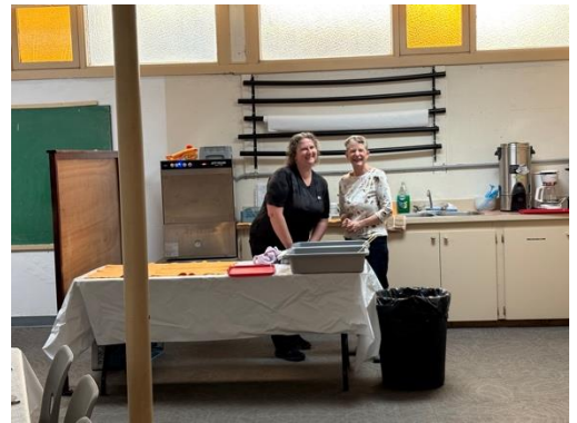
Ready to wash the dishes