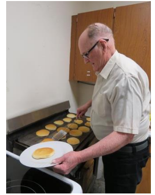
Cooking the pancakes