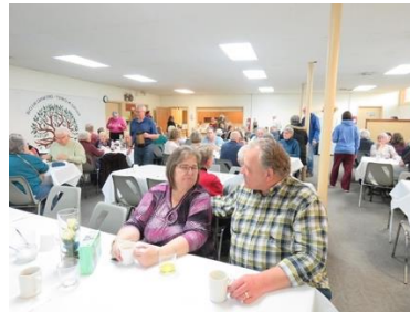
Enjoying food and fellowship