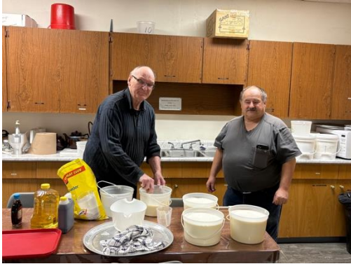
Mixing up the batter